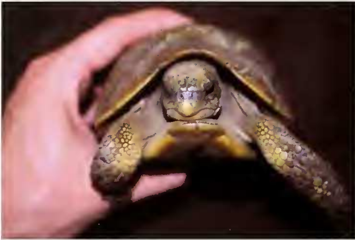
Fig. 6. Kinixys belliana nogueyi from near Bohicon, southern Benin.

Remarks. This specimen was brought to KU by a local hunter. It was taken near Bohicon and was released after photographic documentation.